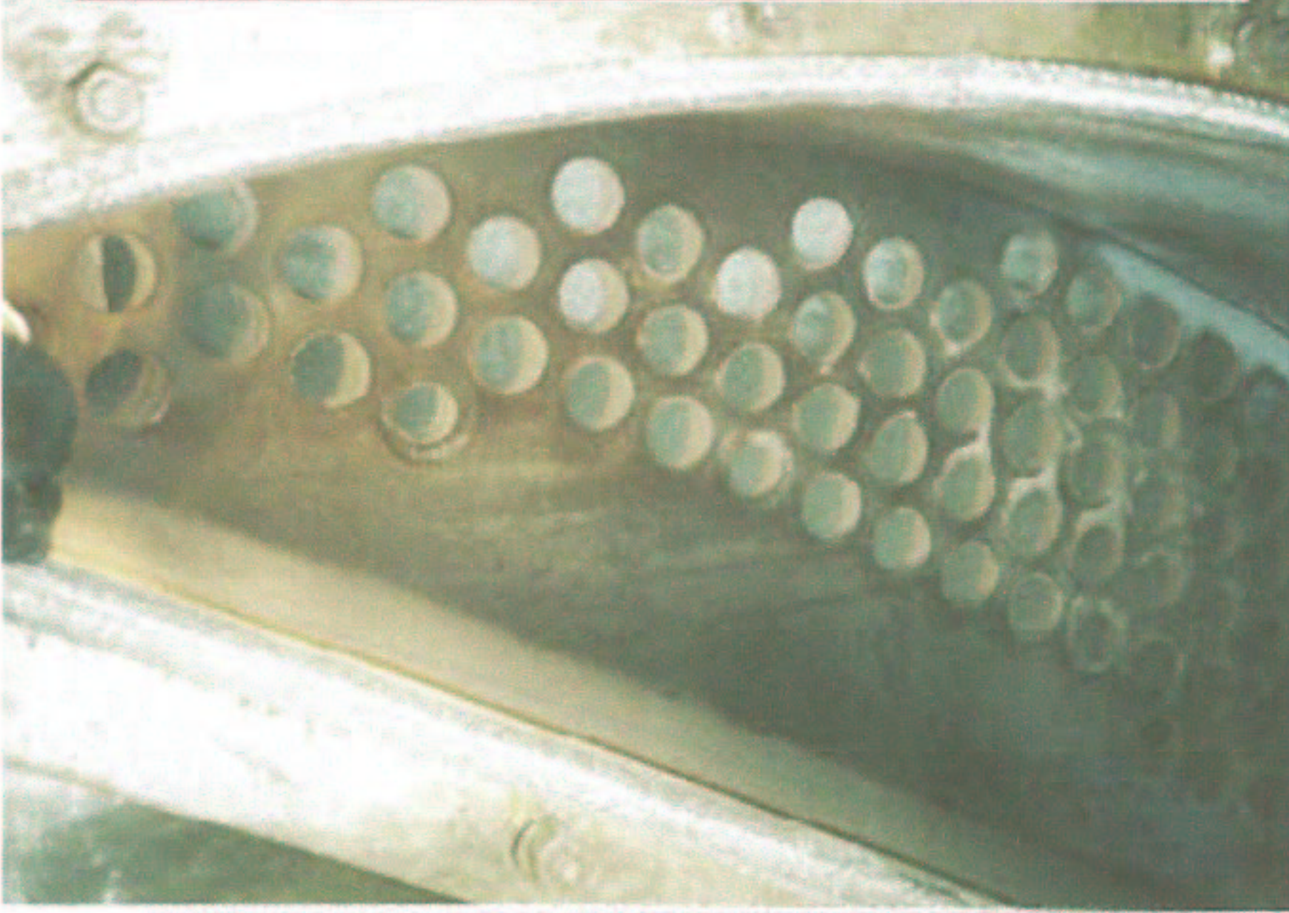
AFTER 6 MONTHS TREATMENT.